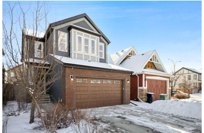
66 COPPERPOND HEATH SE

** Extensive upgrades and superior quality, with 3500 square feet of air-conditioned luxurious living space. You will be impressed with the privacy of an oversized traditional homesite with a private south-facing backyard with a bespoke 13' x 12' covered deck. This seasonal, airy design provides relief from the sunniest to the snowiest days while providing an uninterrupted view of the surrounding gardens. Enjoy this convenient Copperfield Location - Steps away from the ponds, Ice rink, parks, pathways, schools, shopping, soccer, skate park, health care, transit, South Pointe Hospital, and the major south expressways. Living a community lifestyle makes Copperfield an outstanding, safe, and secure community. Rich curb appeal with architectural features - dramatic roof lines, 24' x 21' attached garage with wood-style detailed door & full-sized concrete driveway, covered entry, and brick-faced front complete this spectacular elevation. There are extensive upgrades throughout, and the details are superb. This is a must-see home! Chefâ€™s kitchen includes granite countertops, custom light wood shaker style cabinets/doors, extension trims, high-end KitchenAid stainless steel fridge/dishwasher/microwave/wall oven, gas cooktop range with 5 burners, recessed lighting, oversized central island, peninsula island with a flush eating bar & black granite under mount sink, extra cabinet storage & a