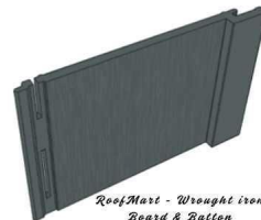
RoofMart - Wrought iron Board & Battan