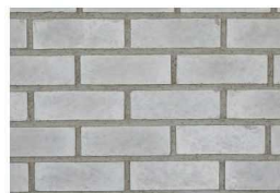
Selkirk - Contemporary Brick Bisque