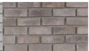
Selkirk - Contemporary Brick Brownstone