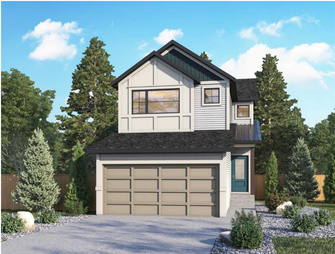
56 Fireside Common

Introducing the Montay by Genesis Builder Group—a thoughtfully designed two-story home featuring 4 spacious bedrooms and 2.5 bathrooms. With a striking open-to-above foyer, this home welcomes you into an open-concept main floor that blends style and functionality. The great room offers a cozy fireplace with a mantle, perfect for relaxing evenings, while the kitchen impresses with a central island ideal for entertaining. A sleek railing guides you to the upper floor, where you’ll find a versatile bonus room and the convenience of an upstairs laundry. The home also includes a double attached garage, 9-foot basement ceilings, a side entry, and basement rough-ins, offering incredible potential for future development. Photos are representative.