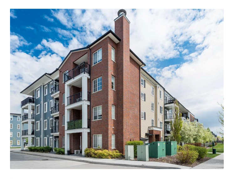
7309-151 Legacy Main St SE, Calgary, AB

Don't miss your chance to call this homeâ€"schedule your showing today!