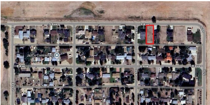
Town of Bassano Vacant Property Listing Details

BEAUTIFUL BASSANO - Welcome to an incredible opportunity to build your dream home in vibrant Bassano for only $5,000! This prime lot has all town services conveniently run to the property line, ready for your vision. Enjoy Bassano's charming community with an outdoor pool, local arena, parks, and a revitalized downtown. Buyers must submit a development permit application within 6 months of signing for a taxable improvement per LUB 921/21. There is also a build timeline requirement and minimum build size of 1400sqft with a front attached garage. Allowed property types include Prefab Homes and Stick Build. Mobile homes are NOT allowed. Call now to get more information as we have multiple lots available!