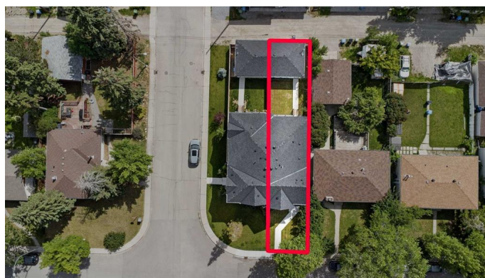
3704 42 St SW, Calgary, AB

Main Floor Exterior Area 942.00 sq ft Interior Area 896.04 sq ft