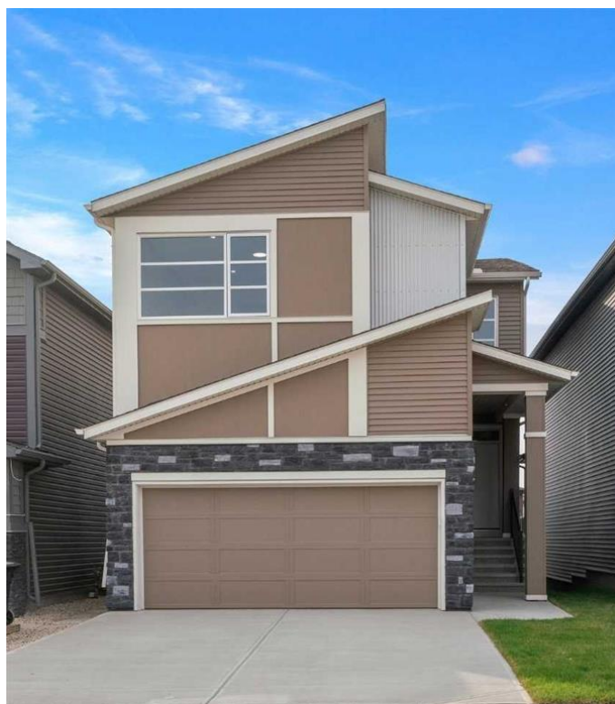
31 Lucas Passage NW, Calgary, AB

Welcome to this high-quality, 4 bedrooms and 3.5 bathrooms brand new built home by Morrison Homes, located in the highly sought-after north community of Livingston in Calgary. The home is close to parks, playgrounds, walking and biking pathways, shopping and easy access to Stoney Trail, Deerfoot Trail, and Cross Iron Mills. Upon entry, you are impressed by the Entrance with a picture window and beautiful tile floor, and wrought iron spindles on the stairs leading to the upper level, an open concept design with 9'™ ceilings, LVP flooring throughout, and enhanced by large west facing windows allowing for tons of natural light in. The main floor also provides a gourmet kitchen complete with a large island, upgraded stainless steel appliances, built in microwave, chimney hood fan, upgraded quartz countertop, a walk-through pantry and a big dining area with two large sliding doors leading out onto a large deck with vinyl surface. The spacious living room boasts an electric fireplace. Additionally, there is a mudroom and powder room on this level. Upstairs features a bonus room with vaulted ceiling, a large primary bedroom with a large window, a walk-in closet, and a 5-pc ensuite with double vanities, a shower, and a tub. Two additional generously sized bedrooms with big windows and great mountain views, a 4-pc family bathroom, and a laundry closet complete the second floor. The walkup fully finished basement provides a bright spacious recreation room with Kitchen